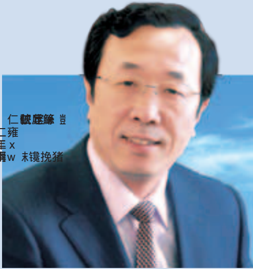
仁 嚴 憲 錄 仁 雍 年 x 車 稱 w 未 機 挽 猪